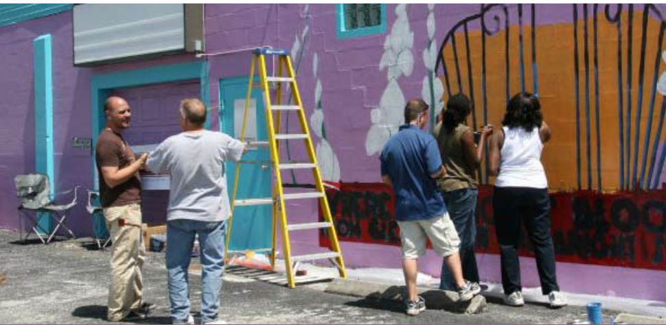
Active community volunteers made good use of a beautiful Florida Saturday by improving their neighborhood.

For more information on the Talento 2010 program, visit www.talento2010.com . ♦