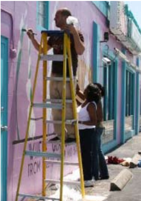
Gladiolas were painted by volunteers to honor building's location, site of original Constantine Farms.

Excellent progress has been made, with establishments such as Greektown Grill, the Frank Crum Building, and The Strand condos moving in. Nature’s