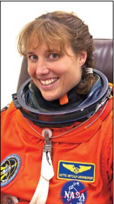
Third teacher into space, Dottie Metcalf-Lindenburger

Inside the shuttle’s cargo bay is the multi-purpose logistics module Leonardo, a pressurized “moving van” that was attached to the station temporarily on April 7 and returned to the shuttle’s cargo bay Thursday, April 15. The module is filled with supplies, new crew sleeping quarters and science racks that will be transferred to the station’s laboratories. This is the final complement of laboratory facilities that will complete the station’s overall research capabilities.